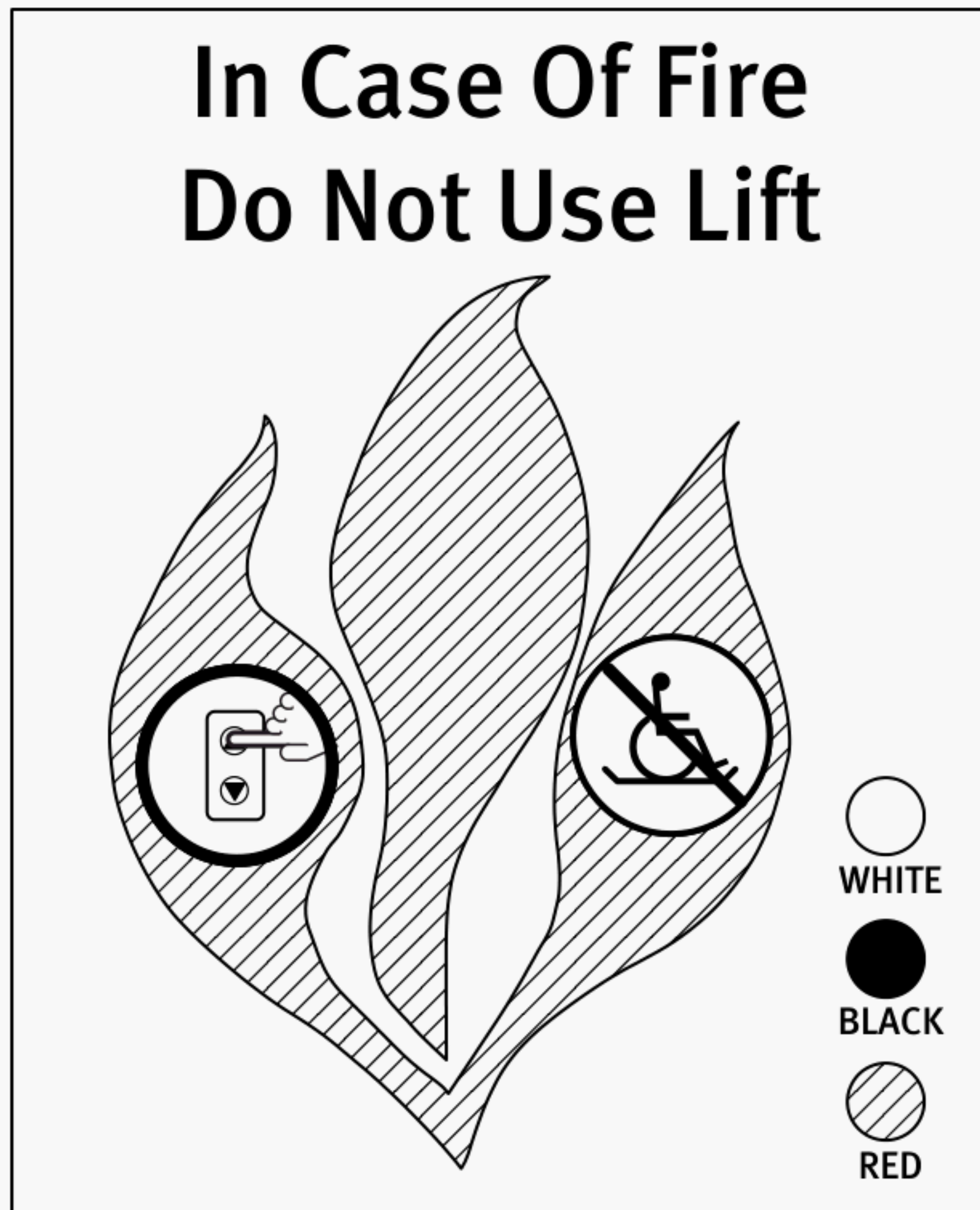
Fig. 2.6.7 Platform Lift Corridor Call Station Pictograph

2.6.7 Protection of Platforms Against Fire. For lifts that penetrate a floor, and when fire resistive runway enclosure construction is required by building code, the underside of wood platforms, the exposed surfaces of wood platform stringers, and edges of laminated platforms shall be protected against fire by one of the following methods: